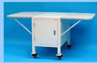
Machine Table TA-26