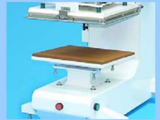
Top + Bottom Heat