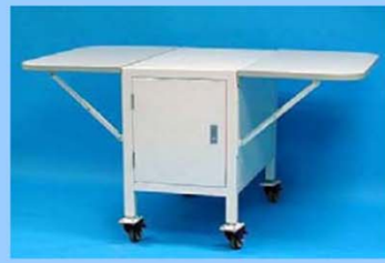
Machine Table TA-26