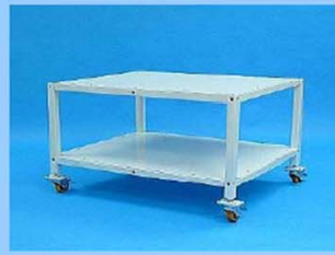
Working Table TA-027