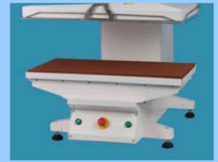
Top + Bottom Heat