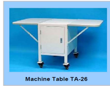
Machine Table TA-26