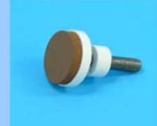
Silicone Platform φ 2.5 inch