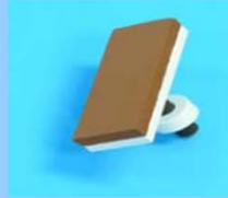
Silicone Platform 6 inch x 2 inch