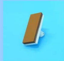
Silicone Platform 6 inch x 2 inch