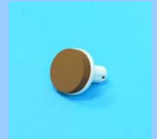
Silicone Platform φ 2.5 inch