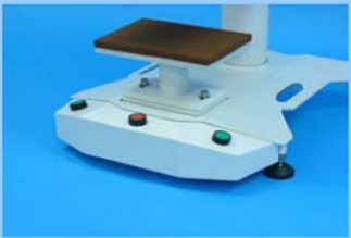
Push Button Control