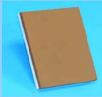
Silicone Platform 8 inch x 6 inch