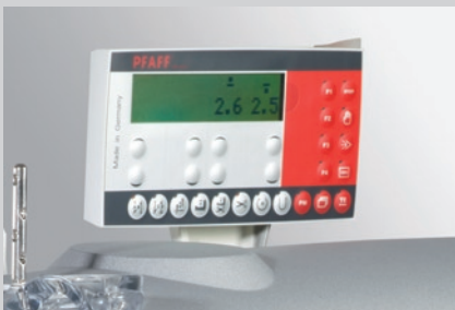
Easy handling of control panel BDF-S3 with integrated data reader (SD-card) for transferring sewing programs and machine software