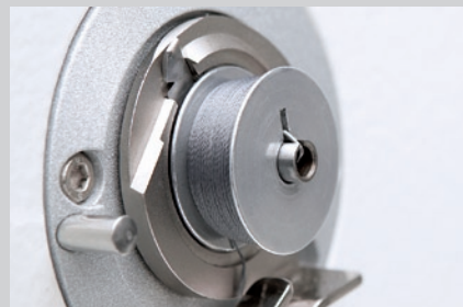
Bobbin winder equipped with an aid for a secure and fast start of the bobbin winding process and within easy reach of the operator („winding assistant“)